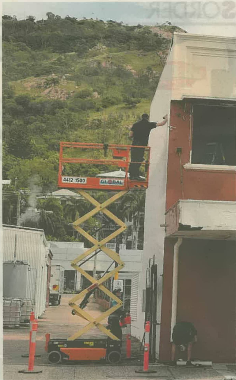
The Flinders Street building gets a makeover.

The new local laws include penalties of up to $26,900 for not complying with a compliance notice, while the council also has power to recover the cost of work where a building owner has not complied with local law.